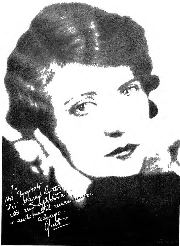
RUTH CHATTERTON IS ONE OF THE LEADING LIGHTS OF THE FILM COLONY IN HOLLYWOOD